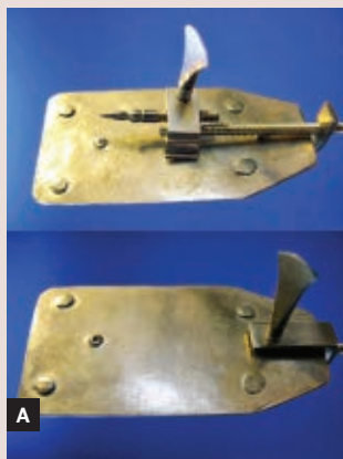
Fig. A: Brass replica of a van Leeuwenhoek microscope (front and back views). You can build one from simpler materials, with the same optics and operating principles.

Flame A portable plumbing torch or Bunsen burner works best, but a disposable lighter or even a candle also works if your glass is thin (e.g., a capillary tube).