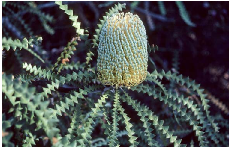
Banksia speciosa , near Esperance, W. Australia. The genus is endemic to Australia.